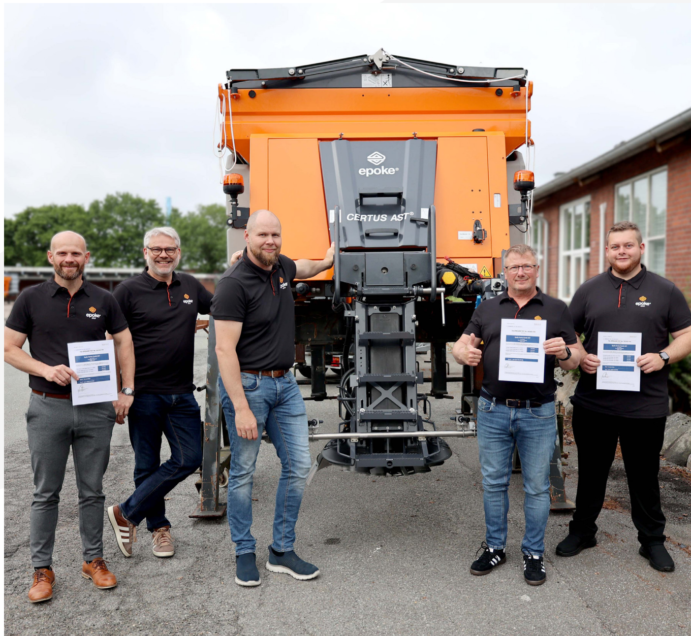
BAST test approved! -2025