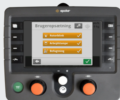
Easy and quick start of spreader