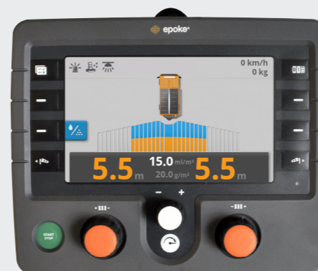
Simple switching between dry matter and liquid spreading