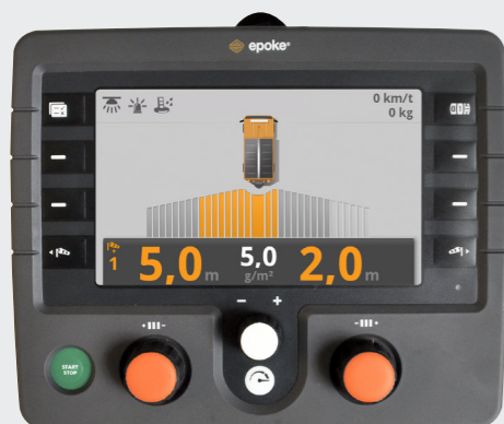
Carefully prepared setup and easy user interface

Temperature range for operation: \pm 20^{\circ}\text{C} to +40^{\circ}\text{C}