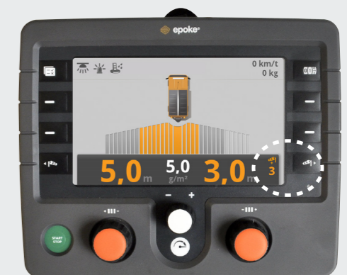
Possible to correct for side wind