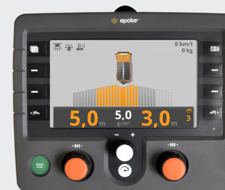
Logical overview of right and left width settings