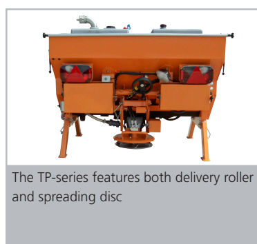
The TP-series features both delivery roller and spreading disc

If spreading with prewetted salt is desired, the tractor spreader may be equipped with a prewetting system and thus used to provide service on slippery roads and paths where prewetted salt is a requirement.