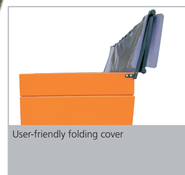
User-friendly folding cover